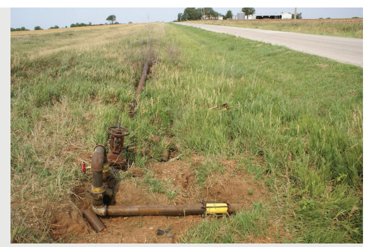
FIGURE 1. Private lines are not always installed to normal standards.

Since the county only has a road easement, it is most people's opinion that the county does not have authority to grant an easement or a permit to a private party to install facilities in the right-of-way. As you might imagine this situation has occurred many times in the past. In fact, there are four attorney general opinions (81-242. 82-27, 82-228 & 99-53), which have opined that the county does not have authority to grant an easement or a permit